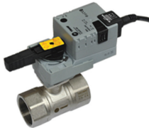
Trane Control Valve (Option)