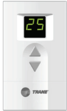
Proportional Thermostat (Option)