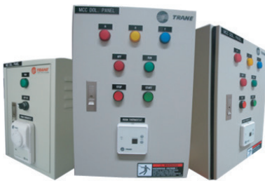
AHU Starter Panel (Option)