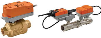
PICV Valve (Option)