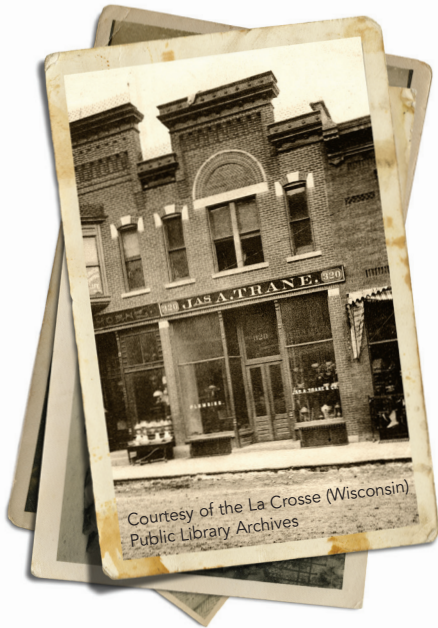
Trane Storefront La Crosse, Wisconsin 1891

When it comes to heating and cooling homes, people view Trane equipment as the most reliable and longest lasting in the industry.* That's because we use premium materials and time-tested designs that deliver more comfort for less energy, with reliability that's legendary throughout the business. When you trust Trane, you're trusting the leader.