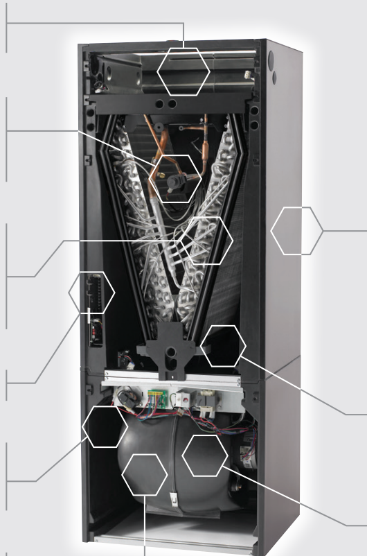
Features and components applicable to Hyperion TAM8 Series only, may vary by model and are shown for illustration purposes only.

➤ Vortica™ Blower uses less energy than conventional blowers to deliver more air, while reducing carbon emissions and noise.