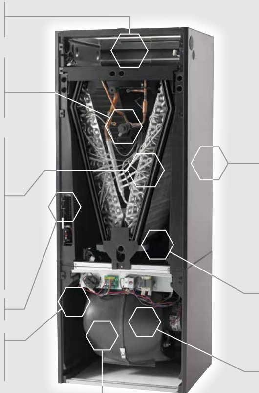
Features and components applicable to Hyperion TAM8 Series only, may vary by model and are shown for illustration purposes only.

➤ Unique Cabinet Design built with tough, double-wall construction and enclosed foam insulation virtually eliminates sweating and condensation. Less moisture and fewer dust particles are drawn in from garages, attics or crawl spaces, helping improve indoor air quality. The cabinet interior is also easy to clean.