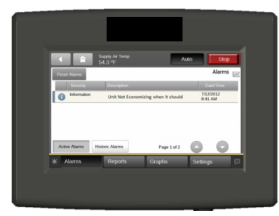
Figure 3. Automatic fault detection implemented in a rooftop unit controller

diagnostics. This mandatory requirement applies to packaged unitary DX airconditioners and heat pumps, regardless of condensing type, if they have an air economizer. The purpose is to identify when sensors and controls on the equipment are not economizing (bringing in more than minimum outdoor air) when outdoor conditions are favorable, or conversely if the economizer is active when conditions are unfavorable. Permanent sensors, economizer status, fault detection, reporting and provisions for test modes are specified by 90.1. This requirement has been in place for several years in California; manufacturers have already developed equipment options that meet the requirements (Figure 3).